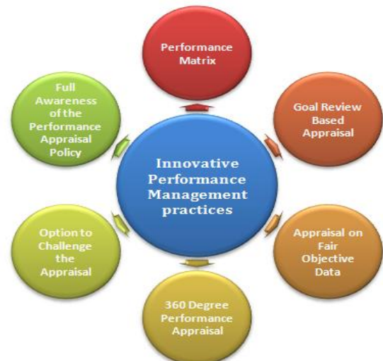
Figure 4. Innovative Performance Management practices