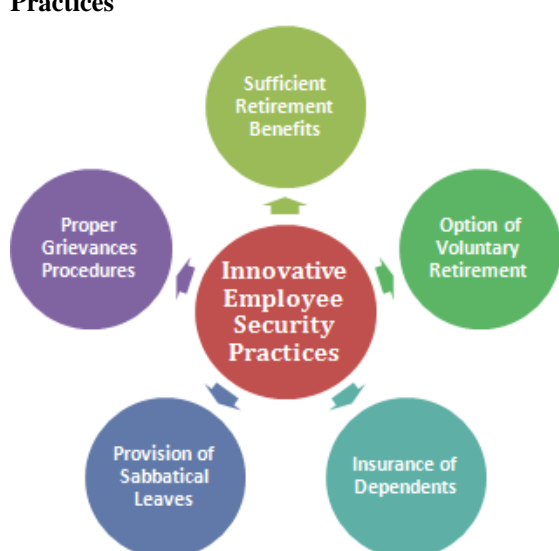
Figure 8. Innovative Employee Security Practices

The exercises which make the employee feel highly secured in his present job are the best suited for this category. These practices when implemented through new ways may help an employee to feel most satisfied in his job. A total of five Innovative Employee Security practices found in the present study were: