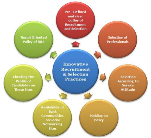
Figure 2: Innovative Recruitment & Selection Practices

This factor includes all those innovative HR practices which aim at attracting maximum number of highly talented applicants and selecting the best to achieve competitiveness (Khan, 2010). The seven innovative HRM practices identified under this head have been explained below: