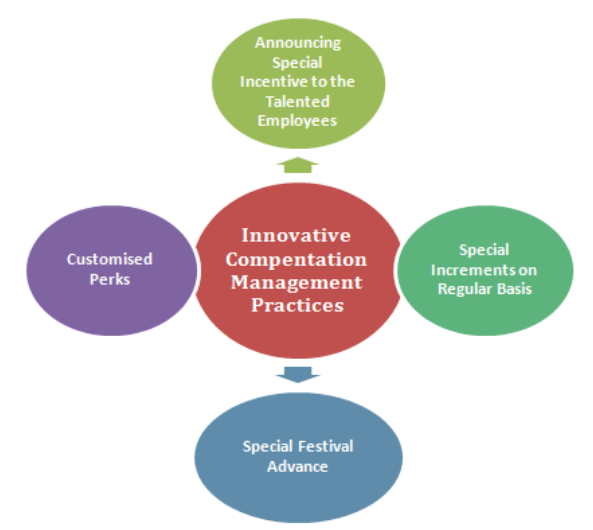
Figure 5. Innovative Compensation Management Practices

Compensation is all forms of financial returns and tangible services and benefits employees receive as part of an employment relationship (Milkovich and Newman 1999). An effective set of choices about compensation systems plays a major role in determining firm performance (Dreher and Dougherty 2005). Explanation given below is related to the four innovations under this head found during the present study: