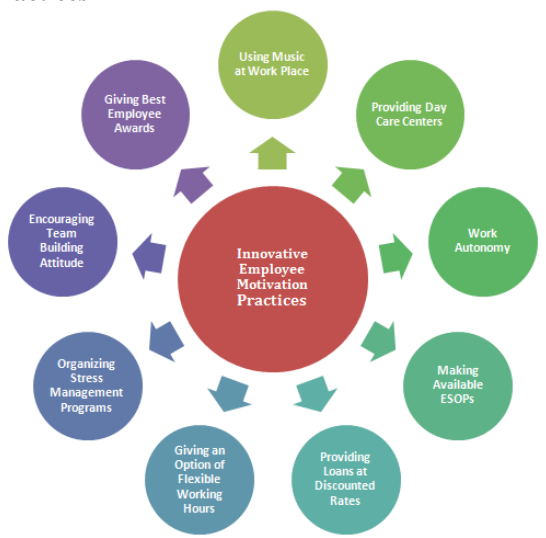
Figure 7. Innovative Employee Motivation Practices

The effectiveness of talented employees will be limited if they are not motivated to perform their jobs (Delaney and Huselid, 1996). This factor of HR practices includes all those innovations relating to motivation of the employees through new ways. In the present investigation, nine innovative motivation practices have been identified. Accordingly, the employees can be motivated in the new ways: