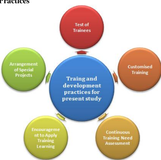
Figure 3: Innovative Training & Development Practices

This factor includes all such practices that generate tangible outcome and intangible results in terms of enhanced self-esteem, high morale, and satisfaction of employees due to acquisition of additional knowledge, skills, and abilities (Khan, 2010). Following are the five innovative Training and Development practices found in the present study: