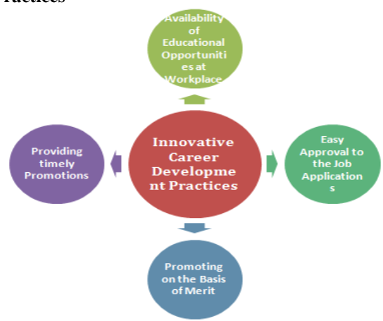
Figure 6. Innovative Career Development Practices

Those innovative career goals, formulating and implementing strategies and monitoring the results are categorised under this head (Greenhaus 1987). These help the employees to groom themselves and manage their careers. Verburg et al. (2007). Following are the five Career Development related innovations: